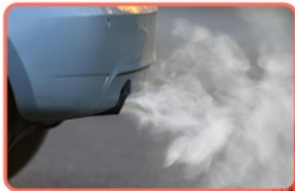
Abnormal exhaust emissions