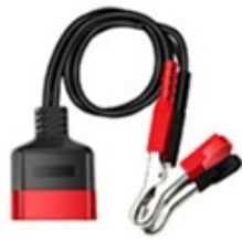
Battery test line