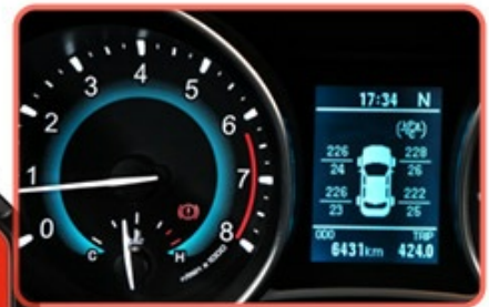
Abnormal fuel consumption