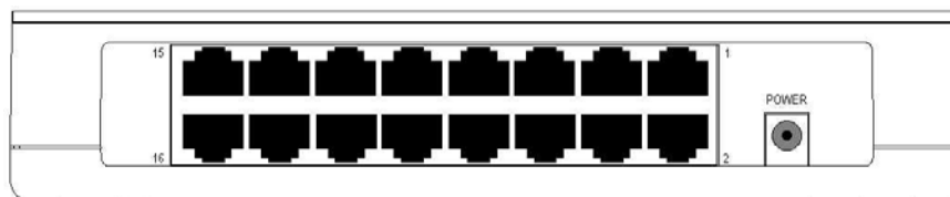
Figure 3-2 TL-SF1016D Switch Rear Panel

The following parts are located on the rear panel: